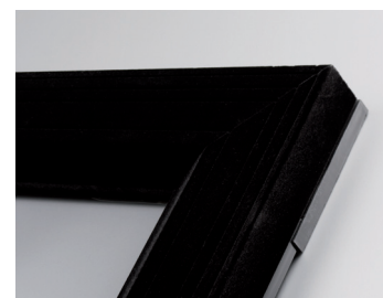
Frame assembly is easy